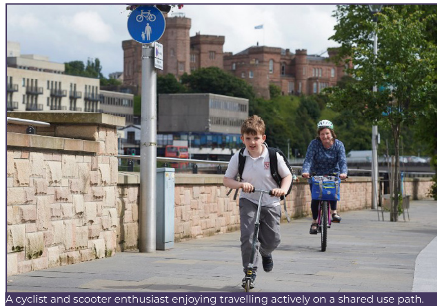
A cyclist and scooter enthusiast enjoying travelling actively on a shared use path.

The Scheme’s project team are now considering the many ways through which the currently designed core network may be enhanced or expanded. It is assumed that a design and consultation process will commence from summer 2021 on these new sections, and that the delivery of these Work Sections will be filtered into the existing construction programme through 2022 and 2023.