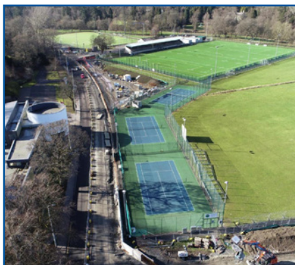
Wall construction alongside Buccleuch Road at the Volunteer and Buccleuch Park