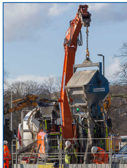
Concrete being poured in between shutters next to James Thomson footbridge to create the flood defence wall