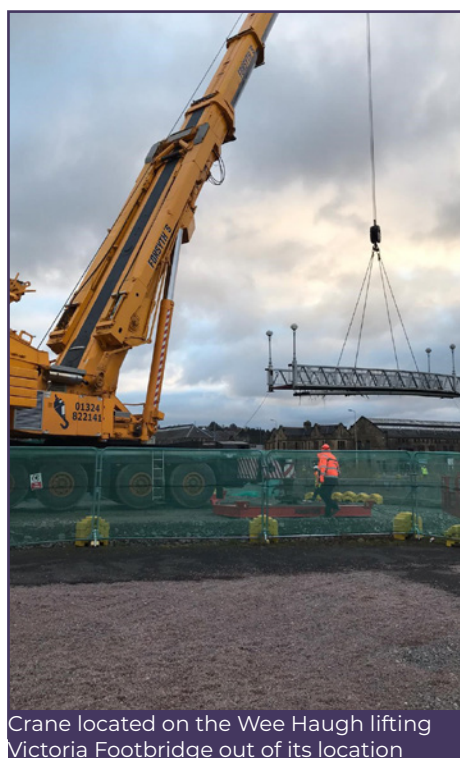
Crane located on the Wee Haugh lifting Victoria Footbridge out of its location