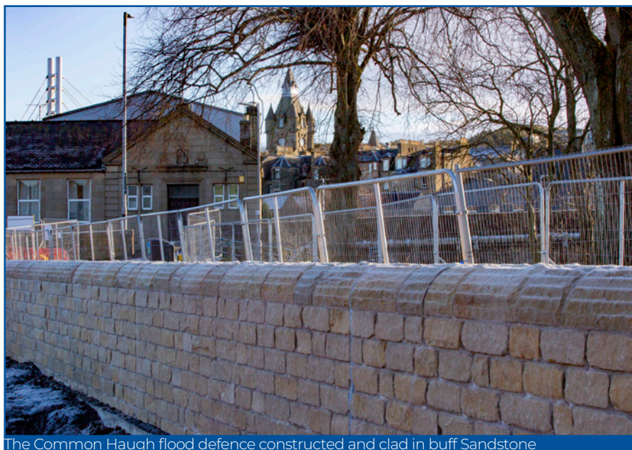
The Common Haugh flood defence constructed and clad in buff Sandstone