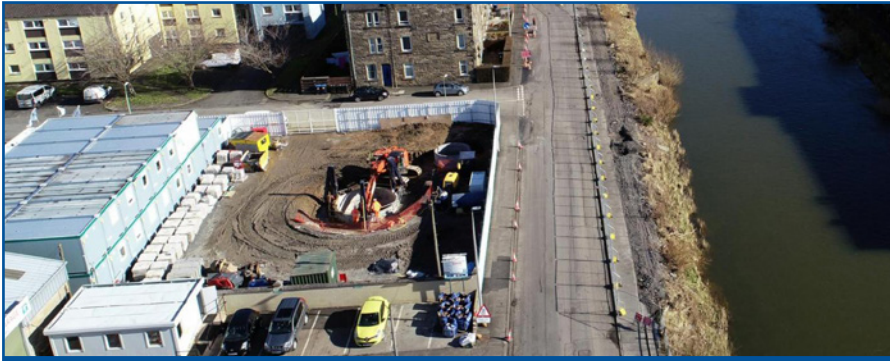
Pumping Station shaft being installed on Mansfield Road