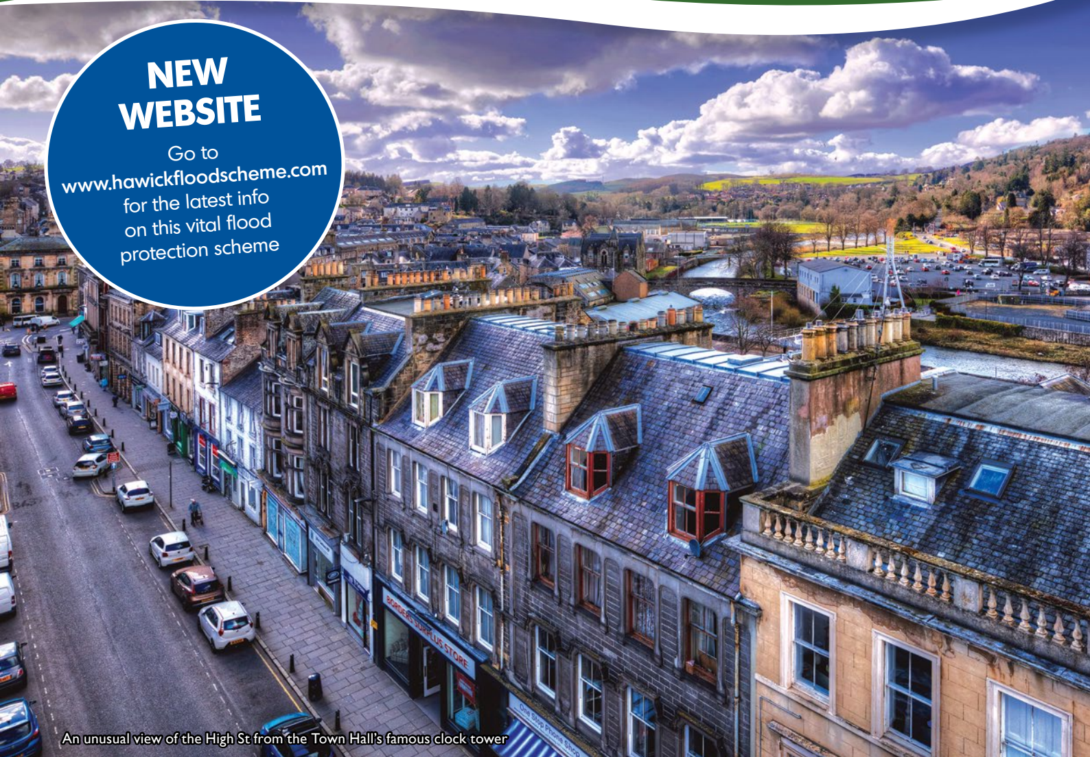
An unusual view of the High St from the Town Hall's famous clock tower

Go to www.hawickfloodscheme.com for the latest info on this vital flood protection scheme