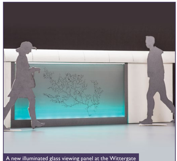
A new illuminated glass viewing panel at the Wittergate