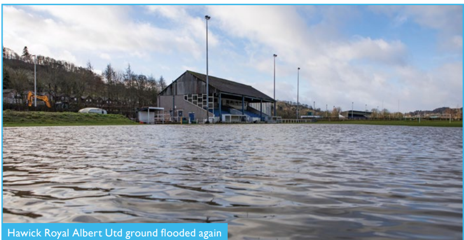
Hawick Royal Albert Utd ground flooded again