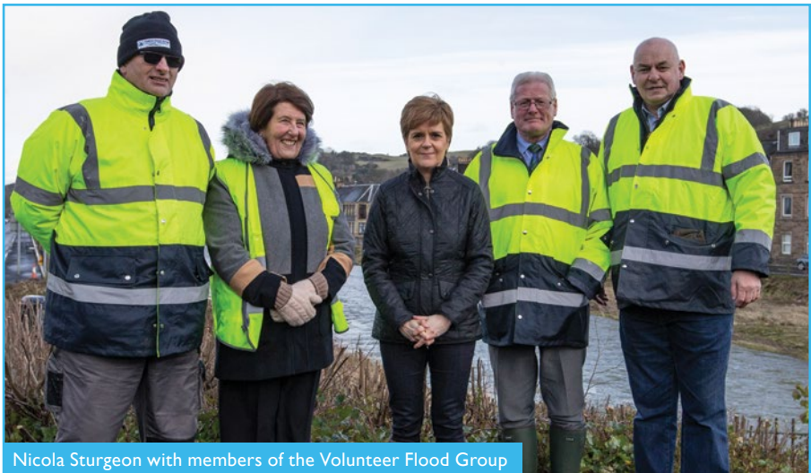
Nicola Sturgeon with members of the Volunteer Flood Group