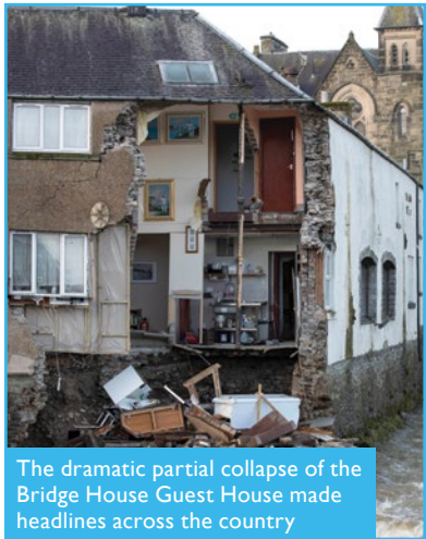
The dramatic partial collapse of the Bridge House Guest House made headlines across the country

In early 2020, storms Ciara and Dennis brought the town to the verge of a major flood event, reinforcing the need for the new flood defences. Whilst only a few properties were flooded, the power of the Teviot and Slitrig Water caused the devastating collapse of the Bridge House Guest House.