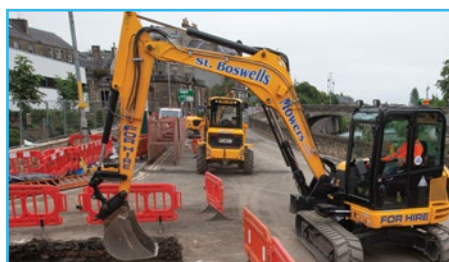
Reinstatement of road surface following combined sewer outfall installation