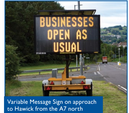
Variable Message Sign on approach to Hawick from the A7 north

Communication is the key, which is why you will have seen not only this newsletter but recent adverts in the Hawick Paper. Also, we regularly update our website www.hawickfloodscheme.com and posts via Facebook and Twitter.