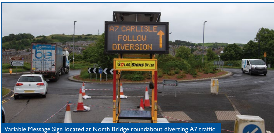
Variable Message Sign located at North Bridge roundabout diverting A7 traffic

This means that we have been able to keep access open to all Commercial Road businesses.