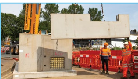
Installation of new combined sewer outfall on Commercial Road

Since the commencement of the Advanced Works Contract in March 2018, great progress has been made in preparing the town for the construction of the flood defences. This has included approximately 19 kilometres of service diversions co-ordinated with the relevant providers, a temporary utility bridge constructed over the river Teviot, the creation of temporary access roads, tree felling and site clearance. This work has been invaluable in clearing the pathway to allow the main works to commence without hindrance.