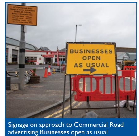
Signage on approach to Commercial Road advertising Businesses open as usual