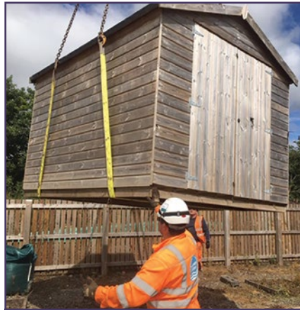
Members of the McLaughlin & Harvey team move the flood relocated shed back into place

It's early days yet, but we are working hard to define what we can offer in each of these areas in the months and years ahead. Examples of community initiatives to-date are: