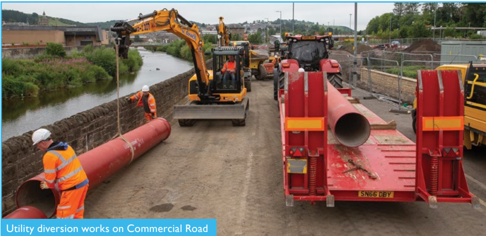
Utility diversion works on Commercial Road